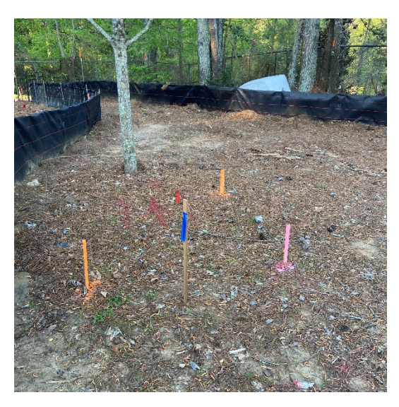
Building and Storm Layout