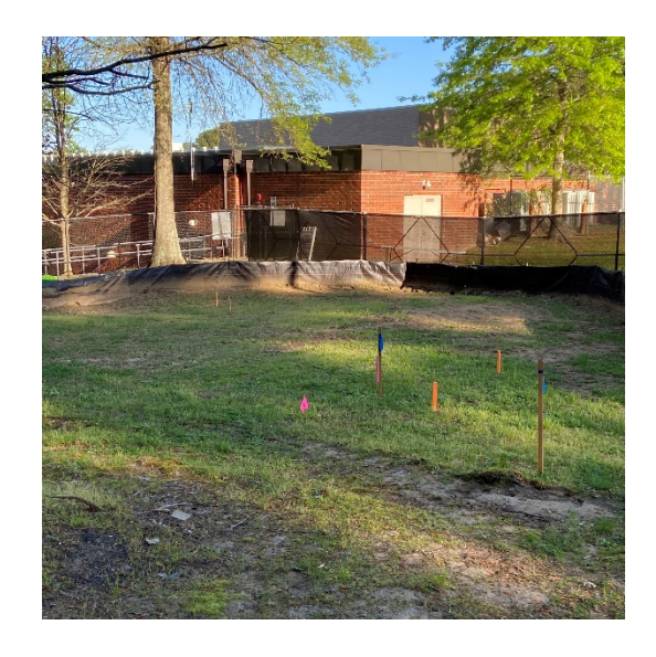
Power Locates and Building Layout